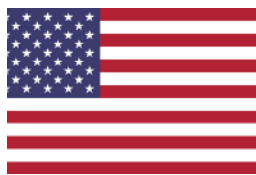
United States of America